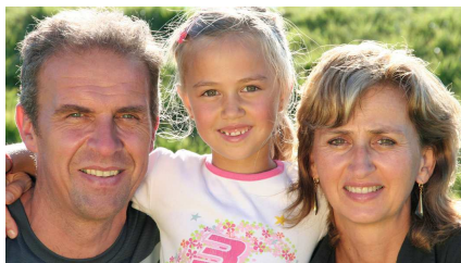
Spending Time Together

Swimming, basketball, running, playing and much more—you name it and the Shoreline Wellness Center probably has it for kids.